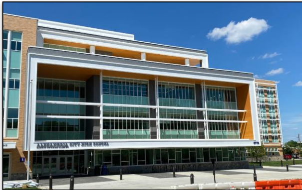
The High School Project: Minnie Howard Redevelopment