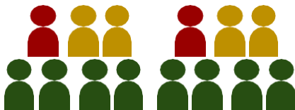
Project Work Team