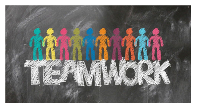
\underline{\mbox{This Photo}} by Unknown Author is licensed under \underline{\mbox{CC BY-SA-NC}}