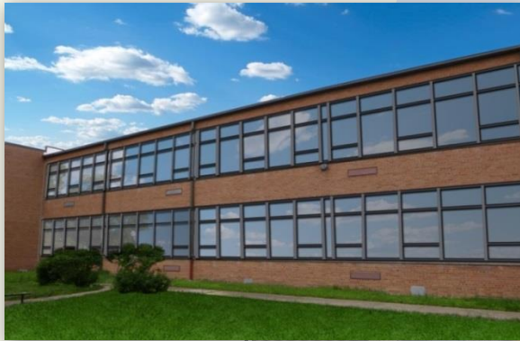
FH EFIS Replacement Rendering