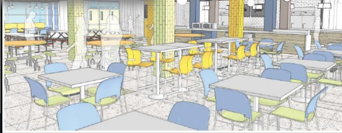
FH Cafeteria Renovation Preliminary Design Sketch