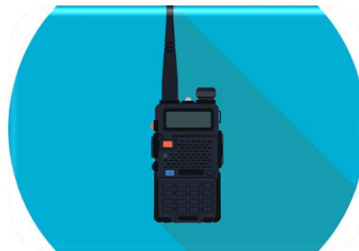
Replacement of Radios