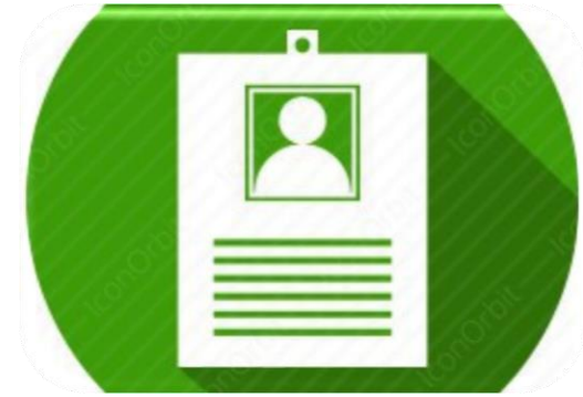
MINGA Student ID Process