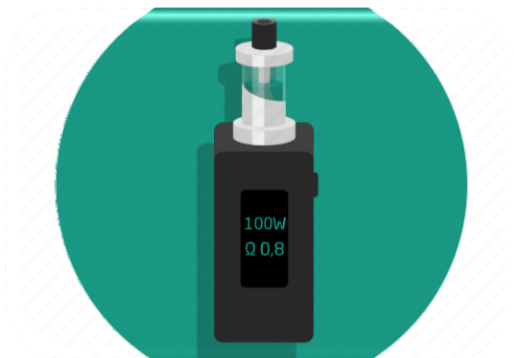
Vape Detection Systems