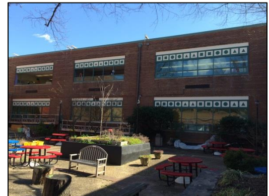
Repaired window system.