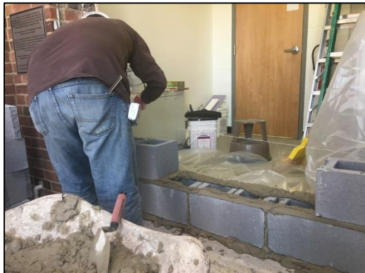
Camera in drain line.