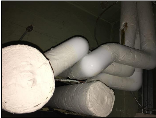
New dual temp pipe insulation.