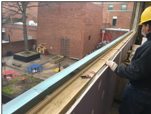
Window system under repair.