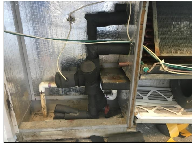
New fan coil unit pipe insulation.