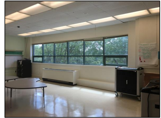
Repaired interior wall.