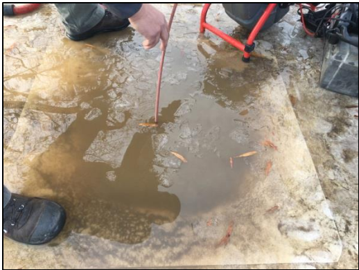
Close-up of camera line.