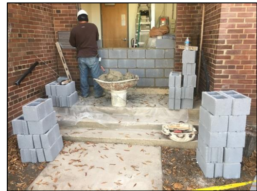
Plugged interior drain line.