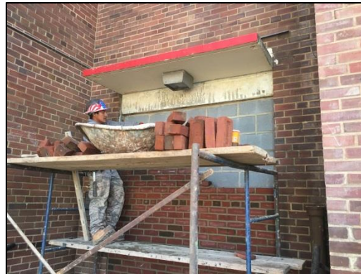
Tracing camera in auditorium.