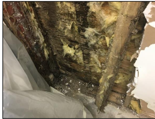
Close-up of camera line.