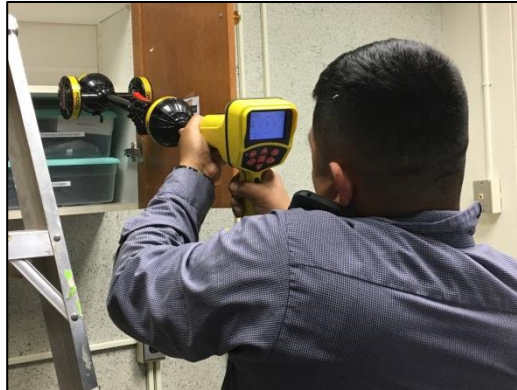
Following camera in drain line.