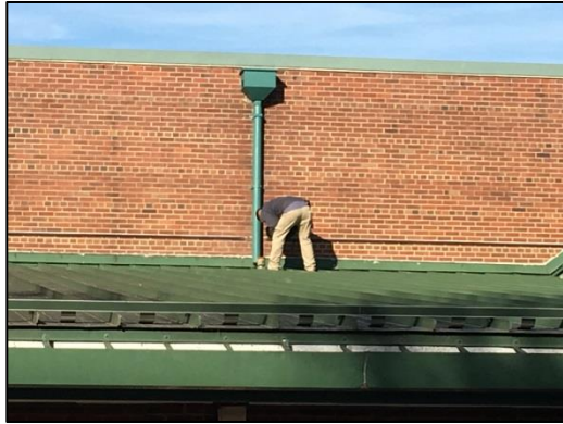
Camera in drain line.