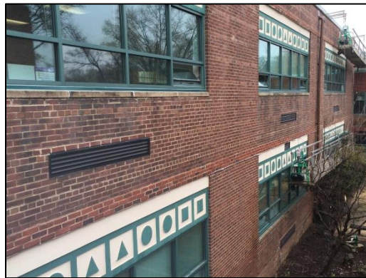
Exterior masonry and flashing.