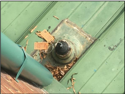
Plugged interior drain line.