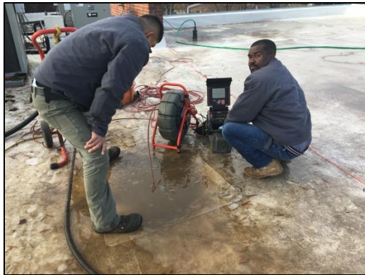
Running camera in drain line.