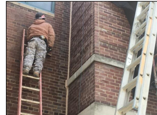
Following camera in drain line.