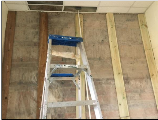
Interior wall vapor barrier.