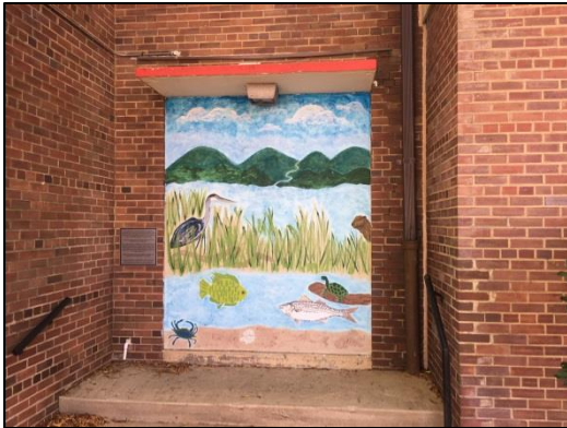
Running camera in drain line.