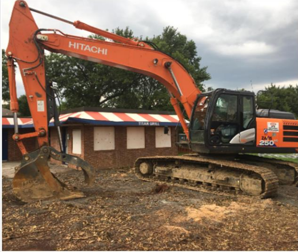
TC Williams Stadium Renovation

(Phase I: Fall; Phase II: Spring Completion)