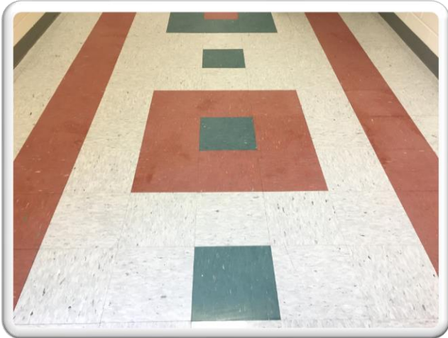
Cora Kelly- 1 st Floor Hallway Before and After