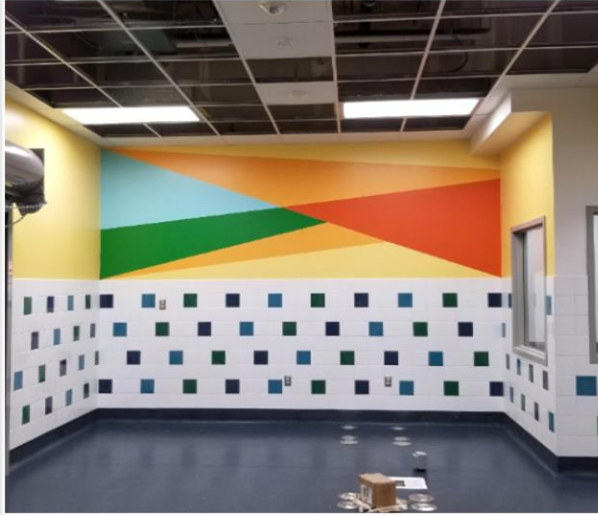
Kitchen and Servery Upgrades

(Phase I: Fall; Phase II: Spring Completion)