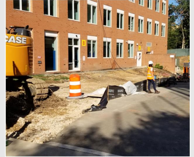
FTD Elevated Gym