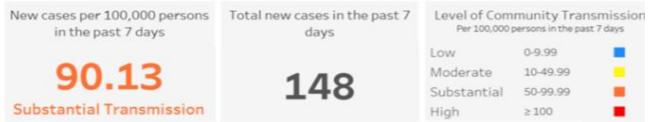
Total new cases per 100,000 persons in the past 7 days Most recent 90 days shown