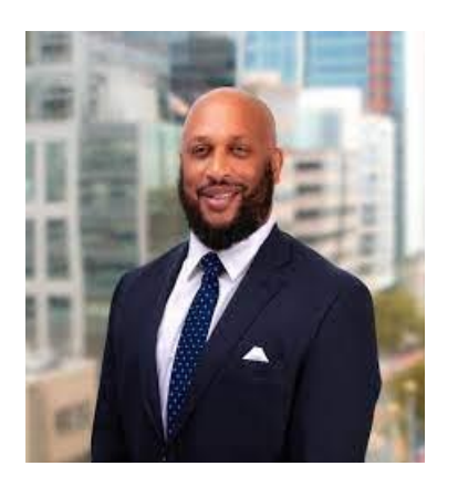
Policy Equity Audit