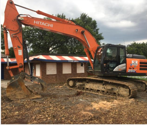
TC Williams Stadium Renovation